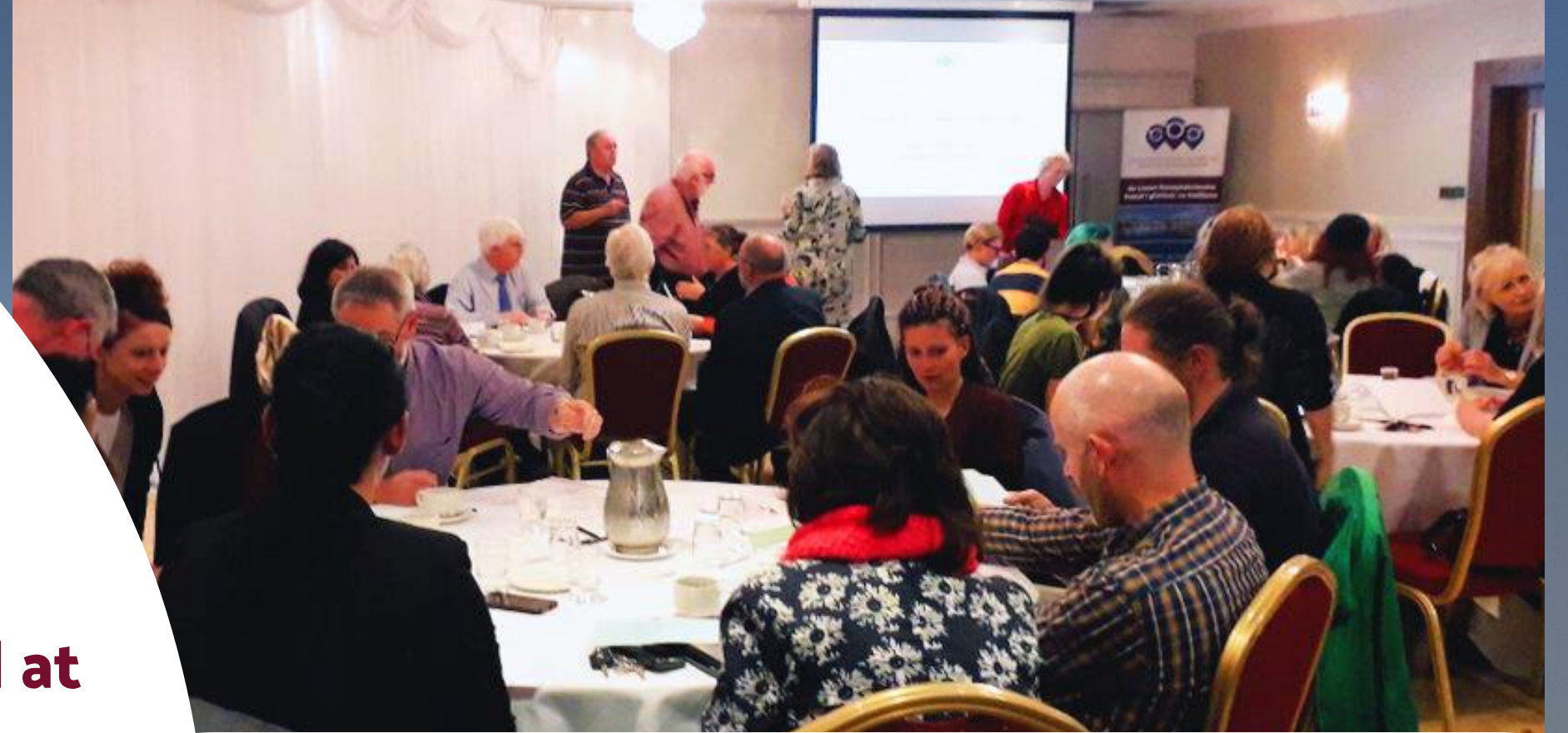
Previous GCCN Representatives Elections in 2019