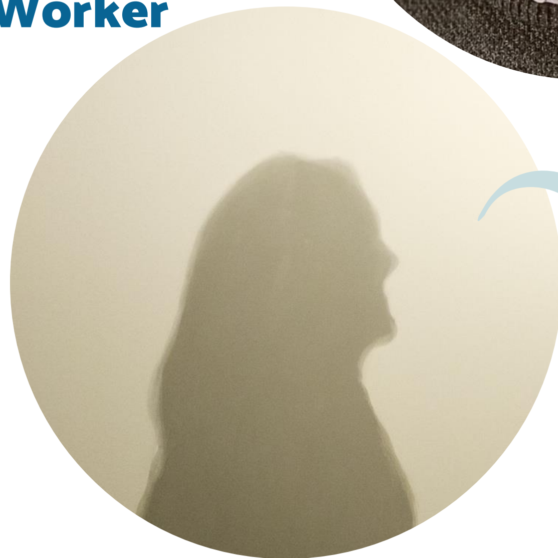
Vacancy Development Worker