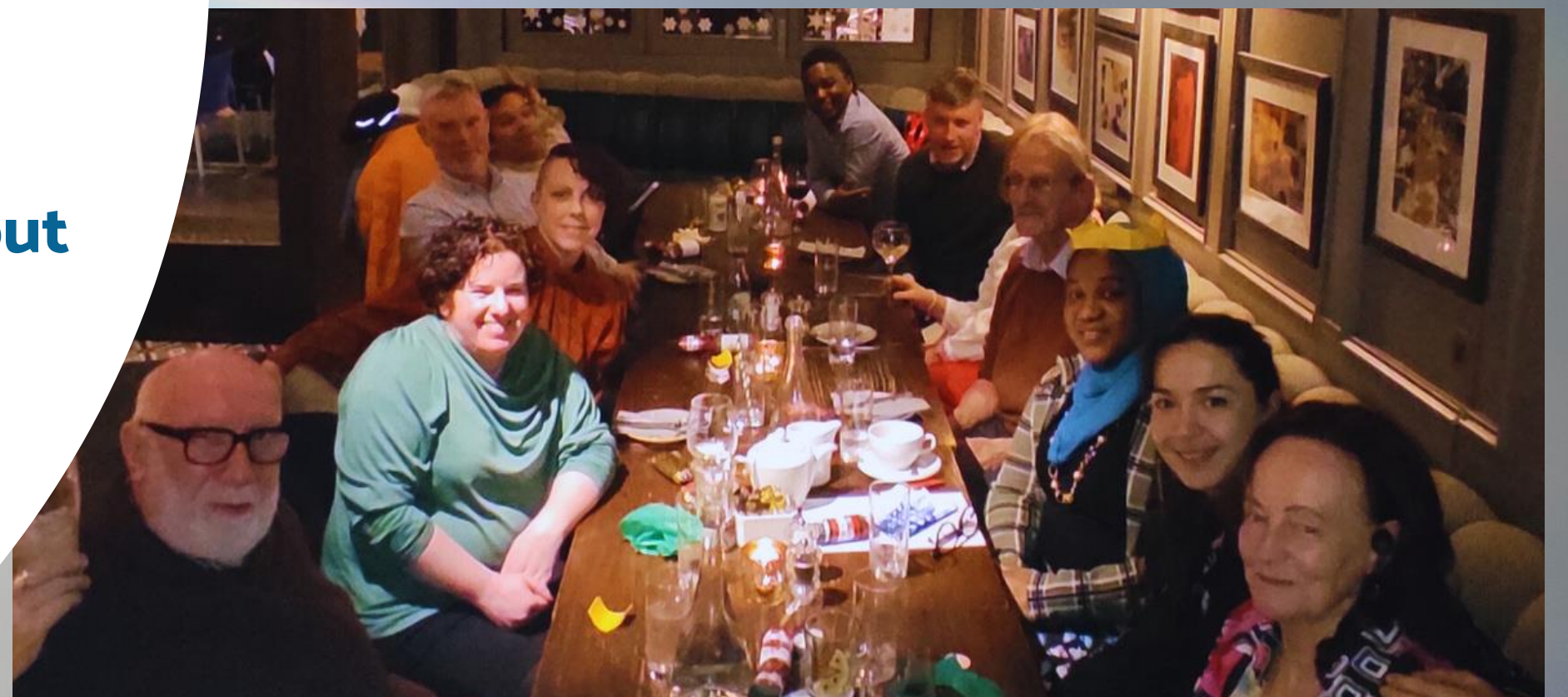
GCCN Secretariat Dinner - December 2023