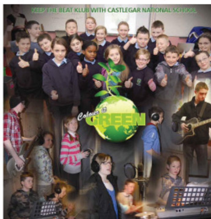
Keep the Beat Members recording Colour it Green with students of Castlegar National School

The Keep the Beat Klub resumes in September, Tuesdays, 7 – 9 pm at Castlegar National School and is open to all families of the school or living in the area.