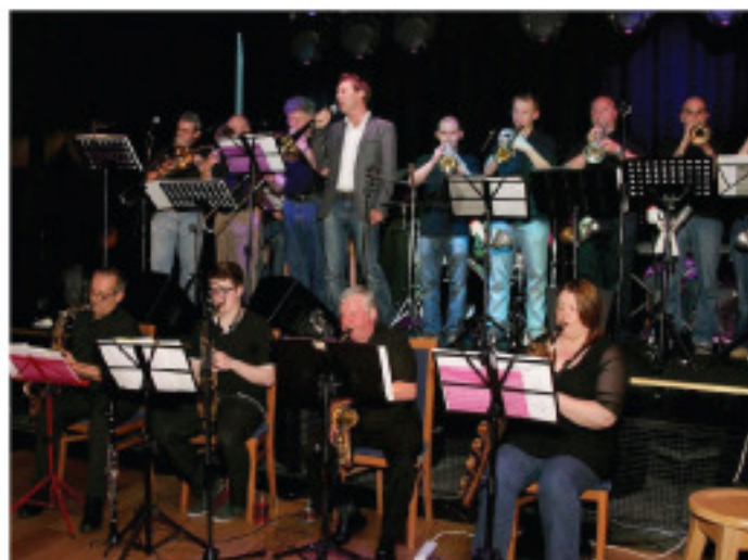
The Black Magic Big Band