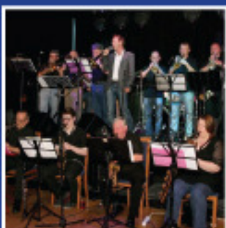
Launch of the History of AIDS West Pg.2