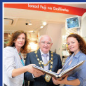
An Ghaeilge ag dul in airde i nGaillimh Pg.5