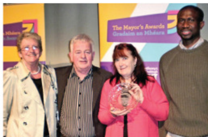
ALâ presented with Mayors Award 2010